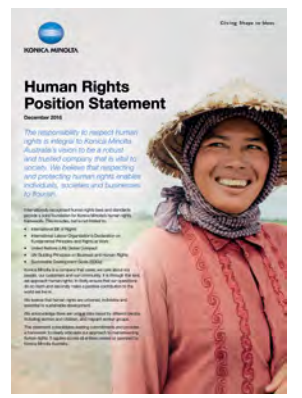
Human Rights Position Statement