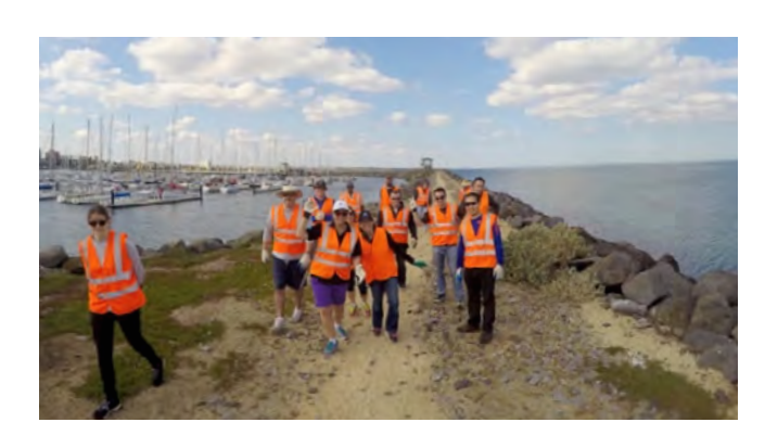
Our Victorian Branch spend a day volunteering at the Port Phillip Eco Centre. The Eco Centre is a community-managed not-for-profit organisation, which reconnects the local community to the natural world through inspiration, education and facilitation of practical action.

Throughout the year, we fund and/or contribute to different causes, projects, initiatives or movement building activities. We evaluate tier two partnerships based on alignment to our values, relevance to our strategic objectives and potential impact.