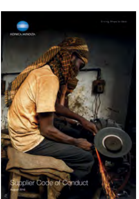
Supplier Code of Conduct