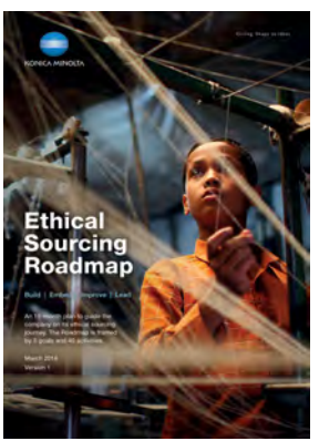
Ethical Sourcing Roadmap

Konica Minolta's human rights framework is built on three core documents: An Ethical Sourcing Roadmap, Supplier Code of Conduct and Human Rights Position Statement. Aligned with the UN Guiding Principles on Business and Human Rights we will continue to know and show that we are respecting human rights.