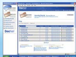
Seamlessly integrated with your Konica Minolta MFP.