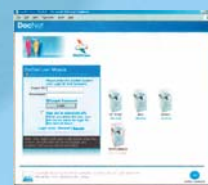
Login system with standard HTTP protocol or secure HTTPS protocol