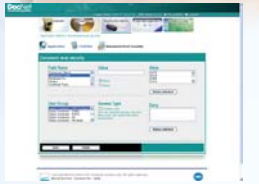
Assign different user groups to access specific document

DLS provides additional controls to the access of filing application. By means of defining which user groups are allowed (or denied) to access document with defined index values, or restricting access of a document to the creator only, this can strengthen the document security to a higher level.