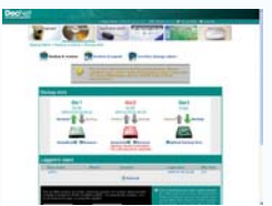
Backup system by easy-to-use interface

Backup database to any media at your choice, e.g. CD-ROM, DVD, MO, floppy disk, portable harddisk, NAS, SAN, RAID etc., so that data can be kept safe even when the hardware of the server is down.