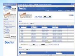
DocNet in Chinese User Interface