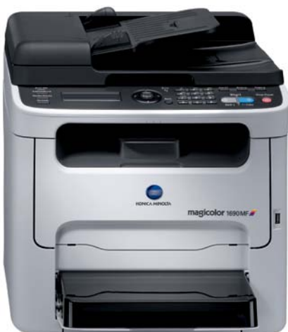
magicolor 1690MF standard