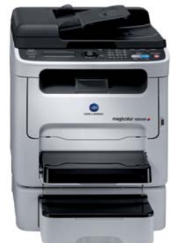
magicolor 1690MF with optional duplex unit and lower paper feeder