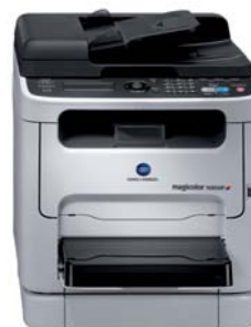
magicolor 1690MF with optional duplex unit and attachment