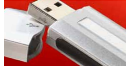
DIRECT PRINT QUICK. SEND PDF, XPS, JPEG AND TIFF FILES DIRECTLY TO THE PRINTER USING A USB FLASH DRIVE, PAGESCOPE WEB CONNECTION OR PAGESCOPE DIRECT PRINT UTILITY. ITS FAST AND CONVENIENT.