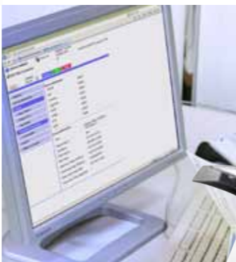
POWERFUL PAGESCOPE™ SOFTWARE. PAGESCOPE WEB CONNECTION FOR WEB-BASED DEVICE MANAGEMENT, PAGESCOPE NET CARE FOR REMOTE CONFIGURATION OF MIBCOMPLIANT PRINTERS, DESKTOP STATUS MONITOR FOR PRINT STATUS REVIEW AND ERROR ALERTS.