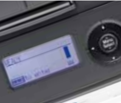
FRONT PANEL IS YOUR INFOLINE. AT-A-GLANCE, DETERMINE TONER LEVELS, PRINT JOB STATUS, AND OFFLINE CONDITIONS. THE INFOLINE-STYLE DISPLAY PROVIDES A VISUAL INDICATION—UP CLOSE AND FROM A DISTANCE—THE STATUS OF THE PRINTER.