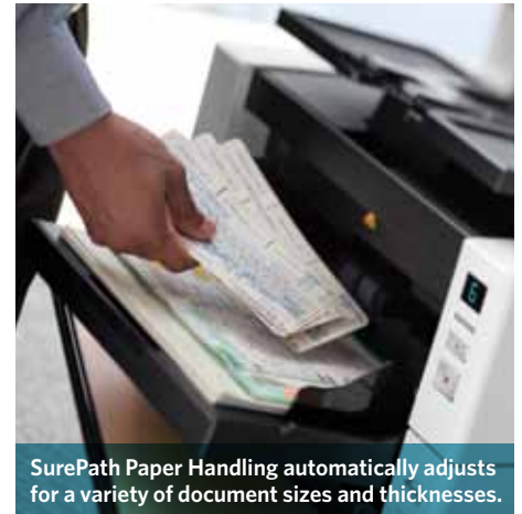
SurePath Paper Handling automatically adjusts for a variety of document sizes and thicknesses.

Smallest scanner in its class to offer a 500-sheet input capacity.