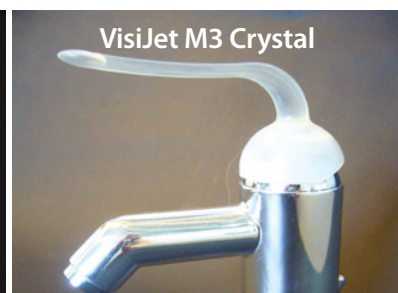
VisiJet M3 Crystal