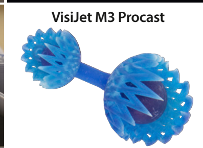
VisiJet M3 Procast