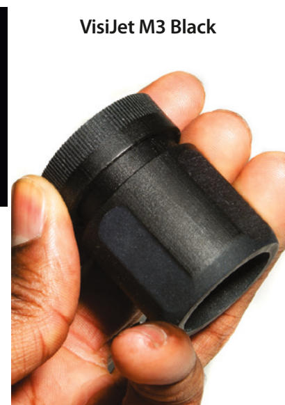
VisiJet M3 Black