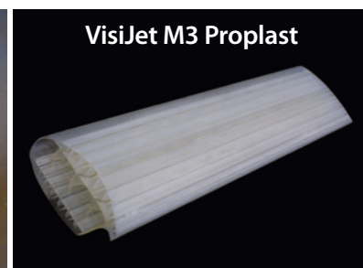
VisiJet M3 Proplast