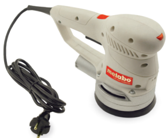
Sander tool housing printed in DuraForm PA material