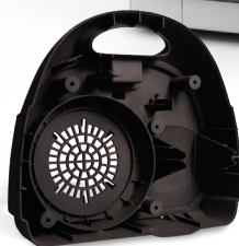
Back cover of vacuum cleaner printed in DuraForm EX Black