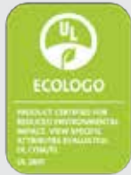
UL ECOLOGO 7

HP Latex Technology delivers all the certifications that matter to your operators, your business, and the environment. 6