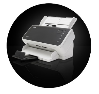
Alaris S2050/S2070 Scanners