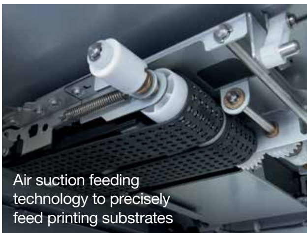
Air suction feeding technology to precisely feed printing substrates

A comprehensive array of inline finishing options are available for the bizhub PRESS 2250P, enabling you to offer your customers more choice. Folding, stitching, stacking, booklet making, perfect binding, smart punching are just some of the options available. Make sure you ask us for a complete list of available finishing options.