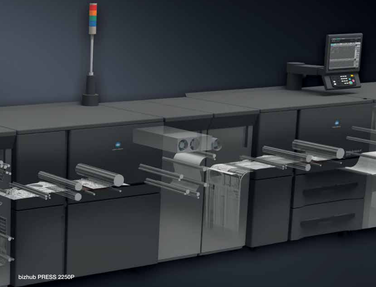
bizhub PRESS 2250P

The bizhub PRESS 2250P can deliver up to 15,000 impressions per hour (A4). It can print simultaneously on both sides of each sheet, and offers the additional benefit of extremely precise front-to-back registration. Equipped with energy efficient Simitri HD toner technology, the bizhub PRESS 2250P delivers excellent quality, producing text and fine lines with ease. Furthermore, image density can be manually or automatically fine tuned on both sides of the page, while the job is on press. With the bizhub PRESS 2250P, you have absolute control when you need it.