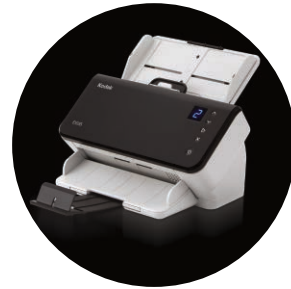
Kodak E1025 and E1035 Scanners

* Throughput speed may vary depending on your choice of application software, operating system, PC and selected image processing features.