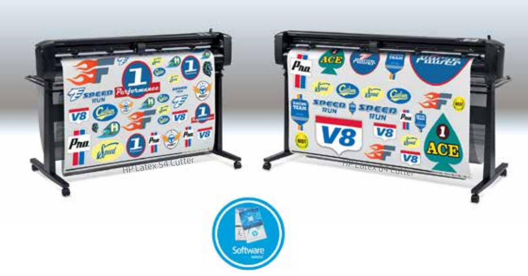
HP FlexiPRINT and CUT RIP

Grow your business by enhancing your HP Latex printer with our unique print AND cut workflow<sup>1</sup>