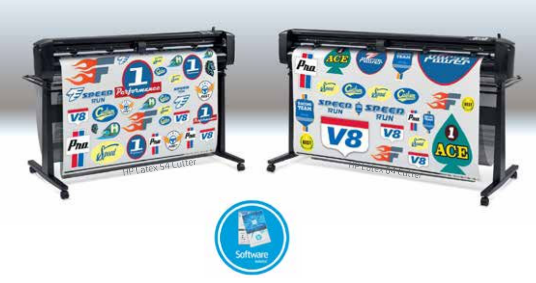
HP FlexiPRINT and CUT RIP

Grow your business by enhancing your HP Latex printer with our unique print AND cut workflow<sup>1</sup>